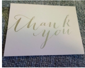
Melody Drake, 10 years old